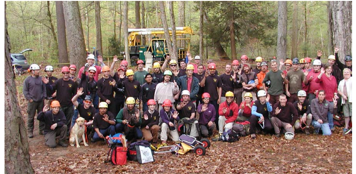
2009 Group Photo – Look Park, Florence, MA

NEW ENGLAND CHAPTER ISA 22nd Annual Tree Climbing Championship June 5, 2010 (rain date: June 6th)